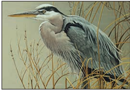
New - Jigsaw puzzles including a 500 piece Robert Bateman Heron. Plus other 1000 piece puzzles and even a 1500 piece one.