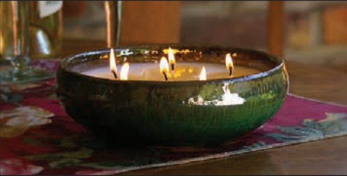
Elegant Candles - 6 wick, non scented candles in a beautiful ceramic bowl which can be re-purposed as a planter or decorative dish.