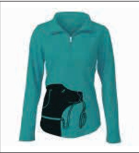
Marushka - French Terry 1/4 zips (as shown), as well as Curly Cats and Sandpipers, plus v-necks and long sleeve styles.