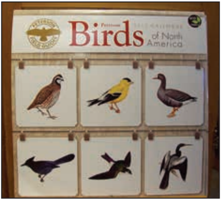
2015 Calendars - Owls, Hummingbirds and Peterson's Birds of North America – Boxed Christmas cards are also now in stock.