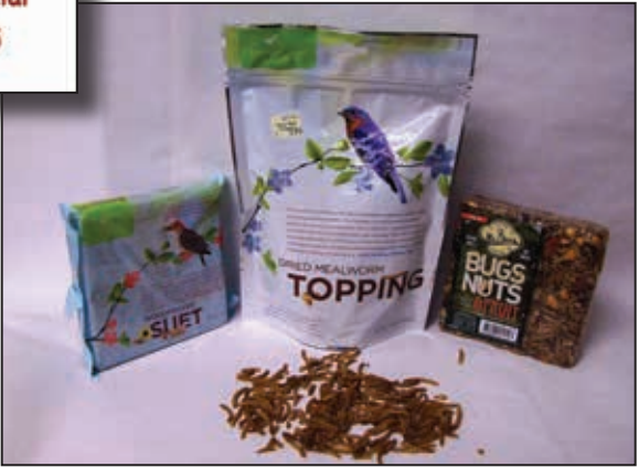
New Treats - Add dried mealworms, Woodpecker Cakes or our newest Fruit, Nut and Mealworm no-suet cake to provide your favourite birds with a special treat, Woodpecker Cake $2.95 ; Fruit, Nut & Mealworm Cake $4.95 ; Dried Mealworm Toppings 100g (approx. 2000 mealworms) pkg $7.95