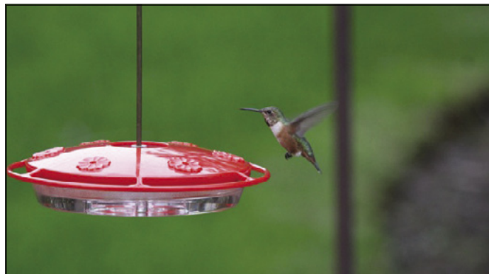
Lise Brayham welcomed a very late but very welcome Rufous Hummingbird to her WBU feeder in North Van. The cold wet spring has delayed their arrival by two to three weeks.