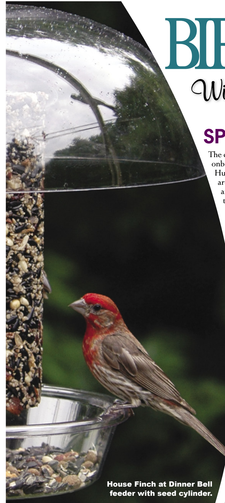
House Finch at Dinner Bell feeder with seed cylinder.

Mon thru Fri 9:30-6 Sat 9:30-5:30 Sun 12-5