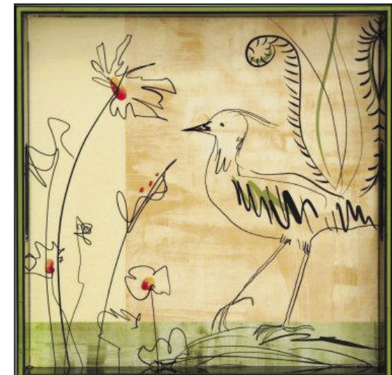
Lacquered wood serving trays in several stunning patterns. $89.95.

These tiny flashlights are the size of a roll of dimes, yet provide an exceptionally bright light. They last 9 hours per charge, and are re-charged in your car's accessory port (formerly known as a cigarette lighter). A must for every car, purse or pocket. $14.95