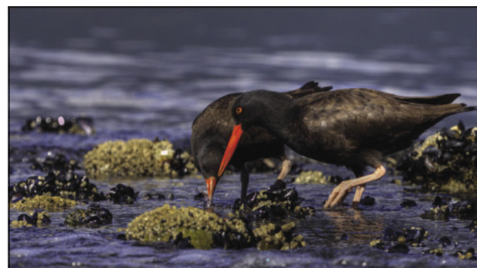
Kyle and Melodie Gosling were camping at Porteau Cove when they discovered that they were sharing a space with an eagle who was lunching overhead. Meanwhile a pair of Oystercatchers were feeding down below at the shoreline.

Colourful glass bowls (Hydrangea shown) on stick-in-the-ground stakes. $29.95 Butterfly, Hummingbird, Dragonfly and Butterfly designs on glass patio bowls. $59.95