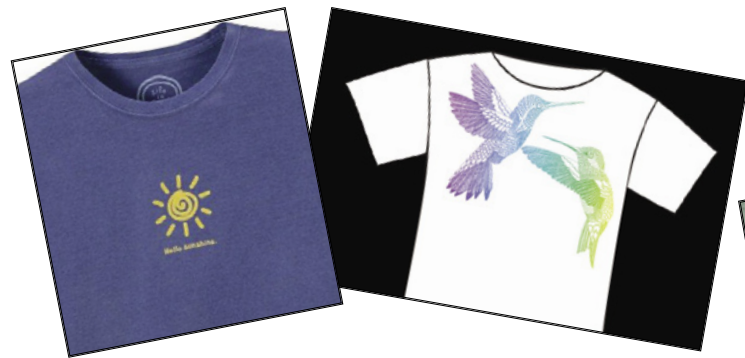
Best quality t-shirts by Life is Good and Colibri pattern hummingbirds in new colours and designs. $34.95

Sterling silver earrings at $24.95 pair, plus 18" pendants and pins make for an ideal gift for Mom.